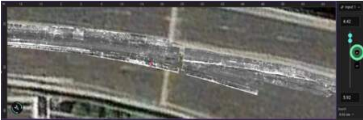
Figure 6. Extended surface layer defects were found at depths of 4 to 6 cm within the asphalt layer.