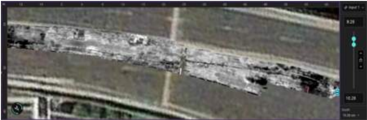
Figure 7. Interface defects between Asphalt-to-Concrete (A/C) layers (Delamination.)