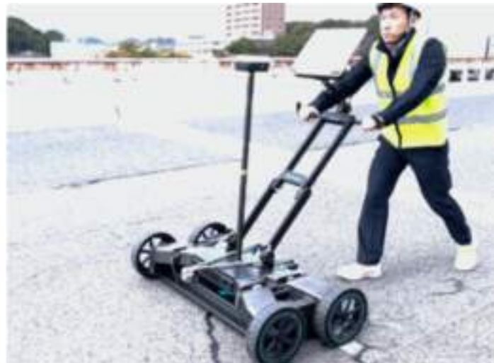
Figure 2 and Figure 3 show the GS9000 system operating on the bridge deck