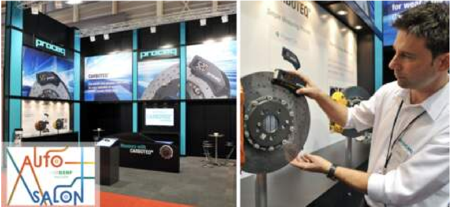
Carboteq carbon ceramic brake disc wear tester

2014 - Proceq introduced the Rock Schmidt rebound hammer specifically for rock testing. The company also delivered yet another solution to a growing problem with the launch of Carboteq, the world's only handheld device to measure the wear of carbon ceramic brake discs.