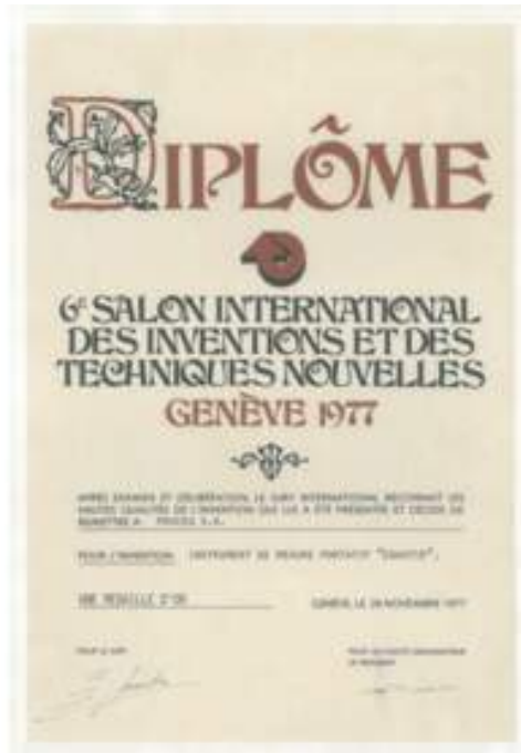
Equotip receives its first official recognition in 1977

1980's - This was a significant decade for rebar detection and concrete cover assessment as Proceq launched the first Profometer rebar locator and cover meters to the market with great success.