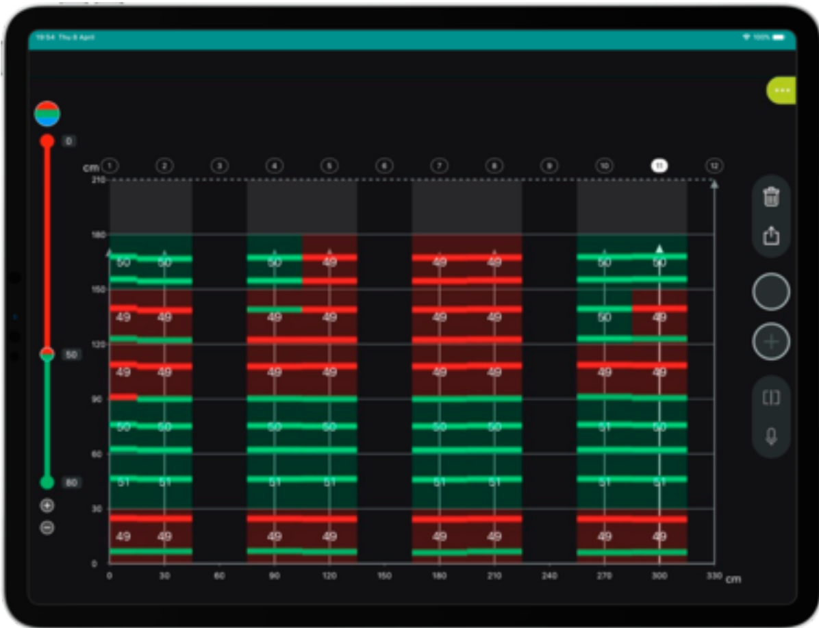
Scanning column's stirrups in vertical scanning direction