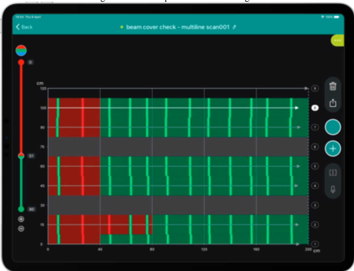
Scanning beam's stirrups in horizontal scanning direction