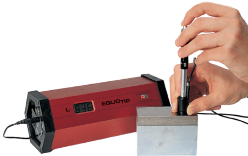
The original EQUOTip