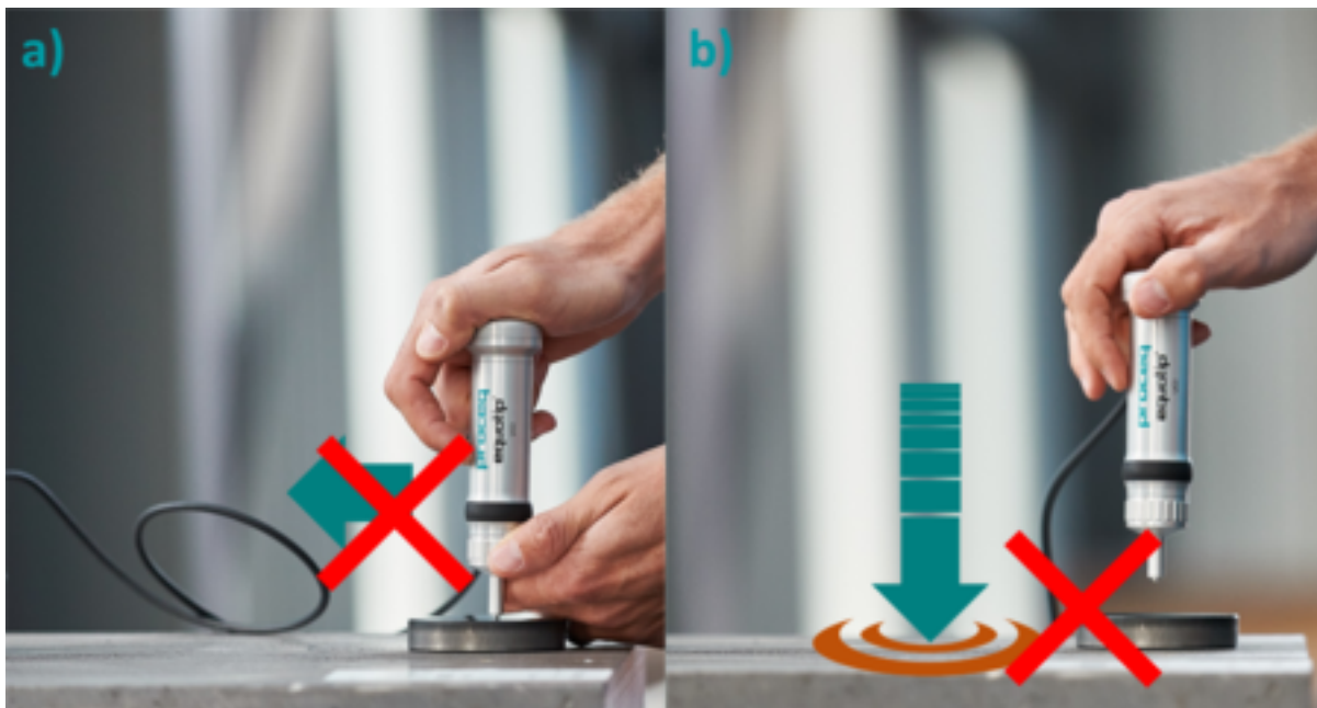
Figure.2. Schematic illustrations of potential probe applications that may lead to damage of the indenter. a) Lateral movements of the probe during the indentation. b) strong impact of the p