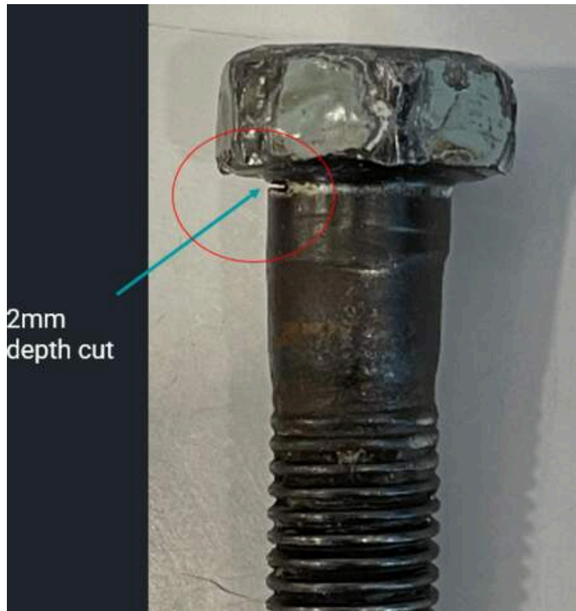
Bolt with a 2mm depth cut to simulate a defect.

For this project, Screening Eagle Technologies' Proceq FD100 flaw detector was used which has conventional ultrasonic testing and phased array testing capabilities and many features to improve efficiency such as calibration wizards and automatic reporting. The UT8000 flaw detector could also be used for this use case.