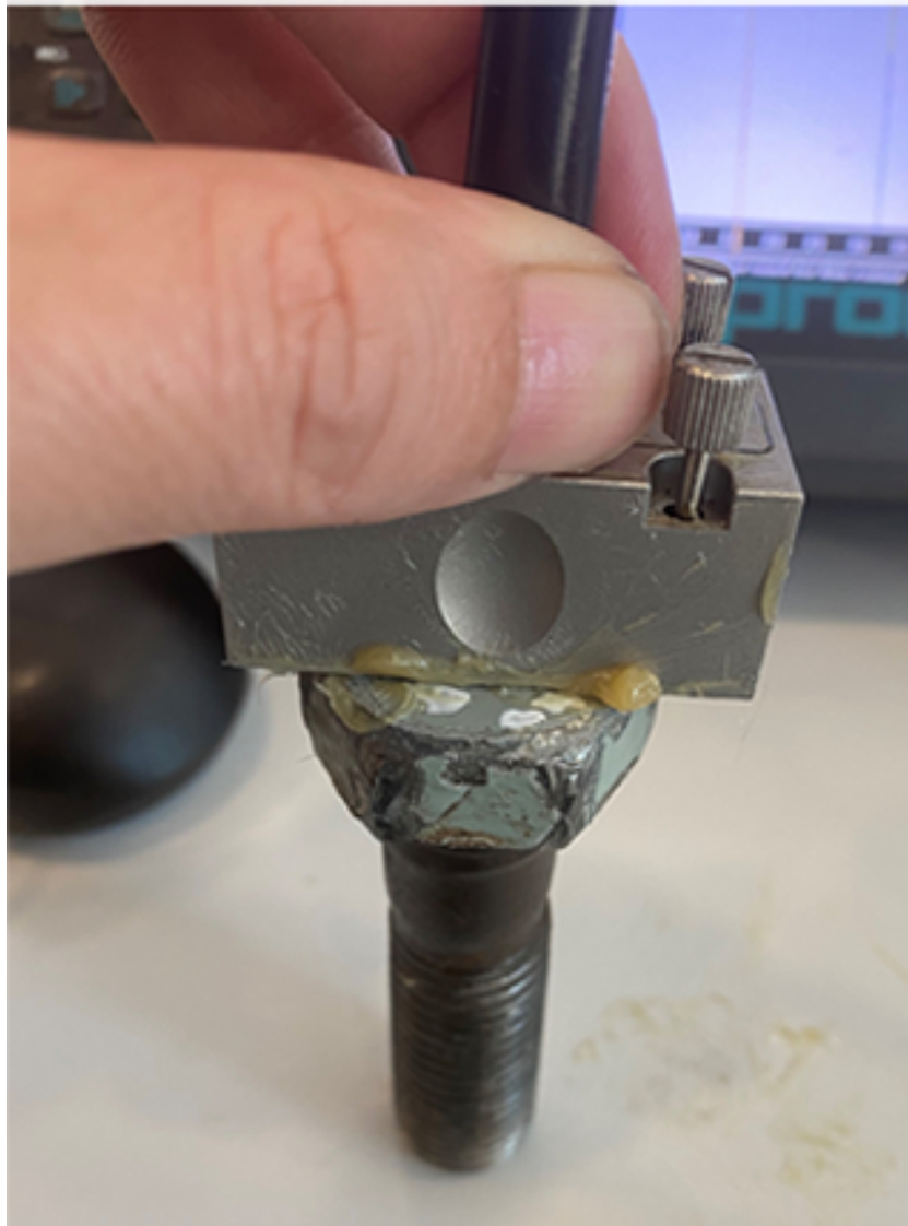
Phased array probe being held on a bolt. The bolt is ex-situ for the 'proof of concept' project but an identical testing method can be used with the bolt in-situ

To test out the proposed solution, a defect was simulated using a 2 mm cut, just beneath the bolt head. Phased array testing was used to get images from the two bolts - one with no cuts and one with the 2mm cut. In the images, the bolt threads and base of the bolt can be identified. And in the bolt with the 2mm cut, an additional indication is visible from the 2mm cut. Further tests were conducted and it was concluded that ultrasonic array technology is a suitable approach for testing and sentencing bolts on-site.