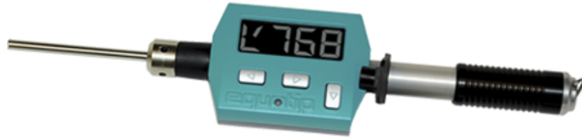
Piccolo 2 & Bambino 2