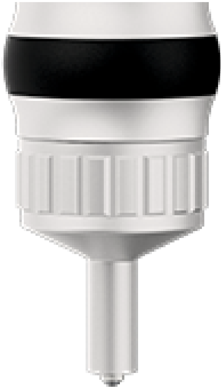
Equotip UCI 3-in-1