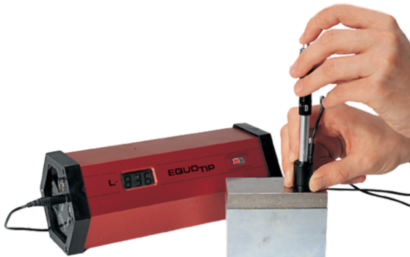
The original EQUOTip