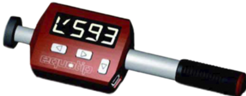
Piccolo & Bambino