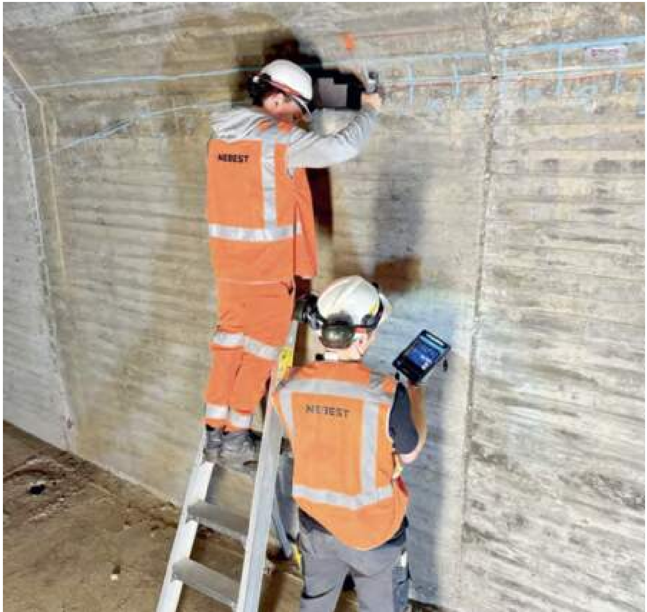
Nebest team using the PD8050 ultrasonic imaging system to detect cavities

Ultrasonic testing with the PD8050 enables the team to map relatively small cavities. In general, we can say that if the cavity cannot be found, it is probably too small to significantly affect the functioning of the structural component.