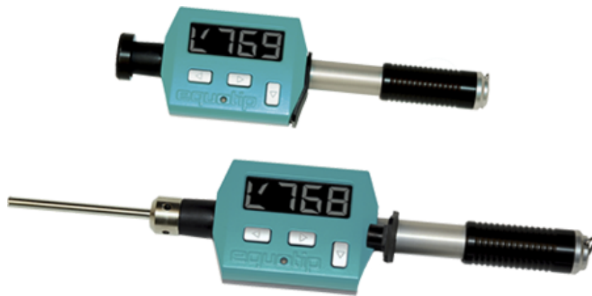
Piccolo 2 & Bambino 2