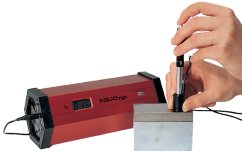
The original EQUOTip